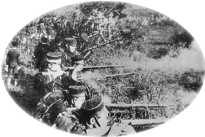
‘ Japanese Soldiers in the First Sino-Japanese War’